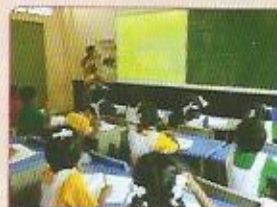
Smart Board C